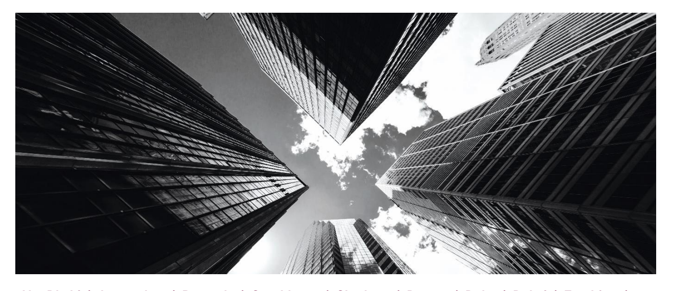
Abu Dhabi | Amsterdam | Brussels | Casablanca | Charlotte | Denver | Doha | Dubai | Frankfurt | Hamburg | Hong Kong | Houston | London | Luxembourg | Lyon | Milan | Montreal | Riyadh | Rome | Seattle | Singapore | Tokyo | Toronto |

Sia Partners is a next generation consulting firm focused on delivering superior value and tangible results to our clients as we navigate the digital revolution. Our global footprint and our expertise in more than 30 sectors and services allow us to enhance our clients' businesses worldwide. We guide their projects and initiatives in strategy, business transformation, IT & digital strategy, and Data Science. As the pioneer of Consulting 4.0, we develop consulting bots and integrate AI in our solutions.